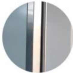
Auto PU Sealing