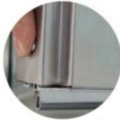
Automatic Drop-down Bottom Seal