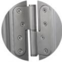
Dismountable S.S Hinges