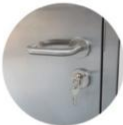
S.S Handle Lock