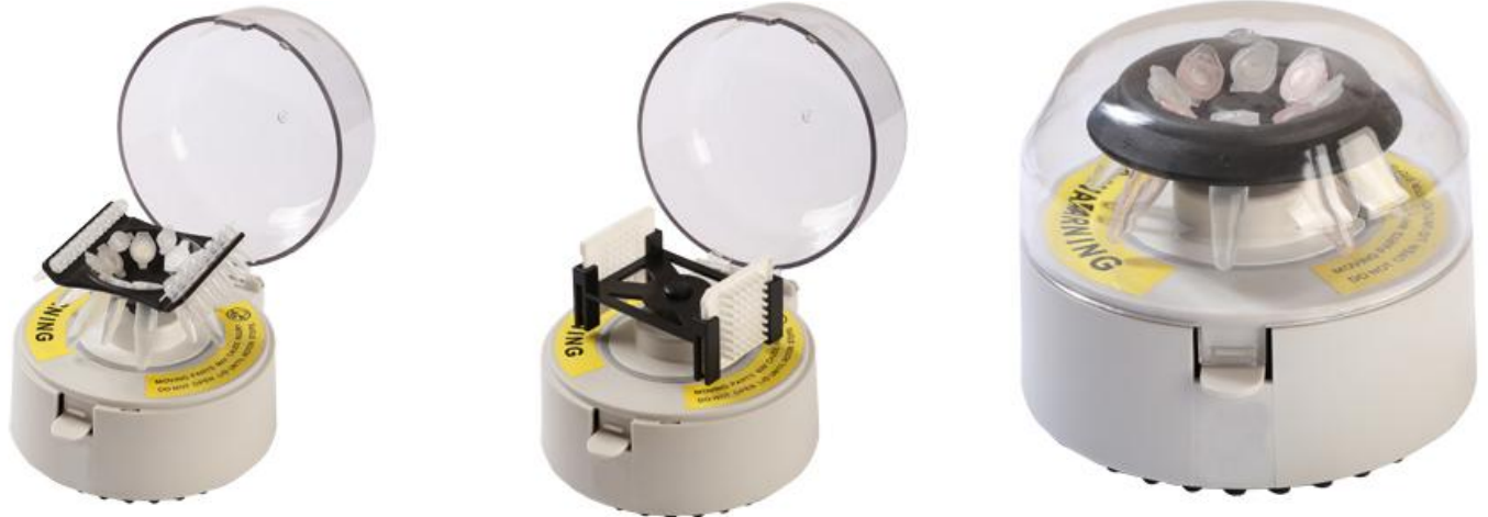
Mini Centrifuge / Micro Centrifuge (Model # MC-4/6)